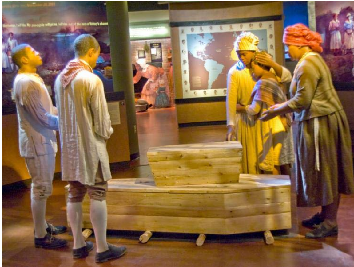
African Burial Ground National Monument